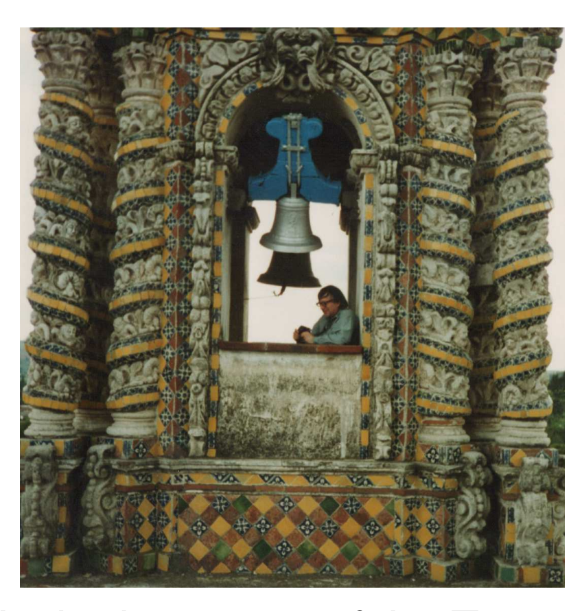
At the bell tower of the Temple of San Francisco Acatepec