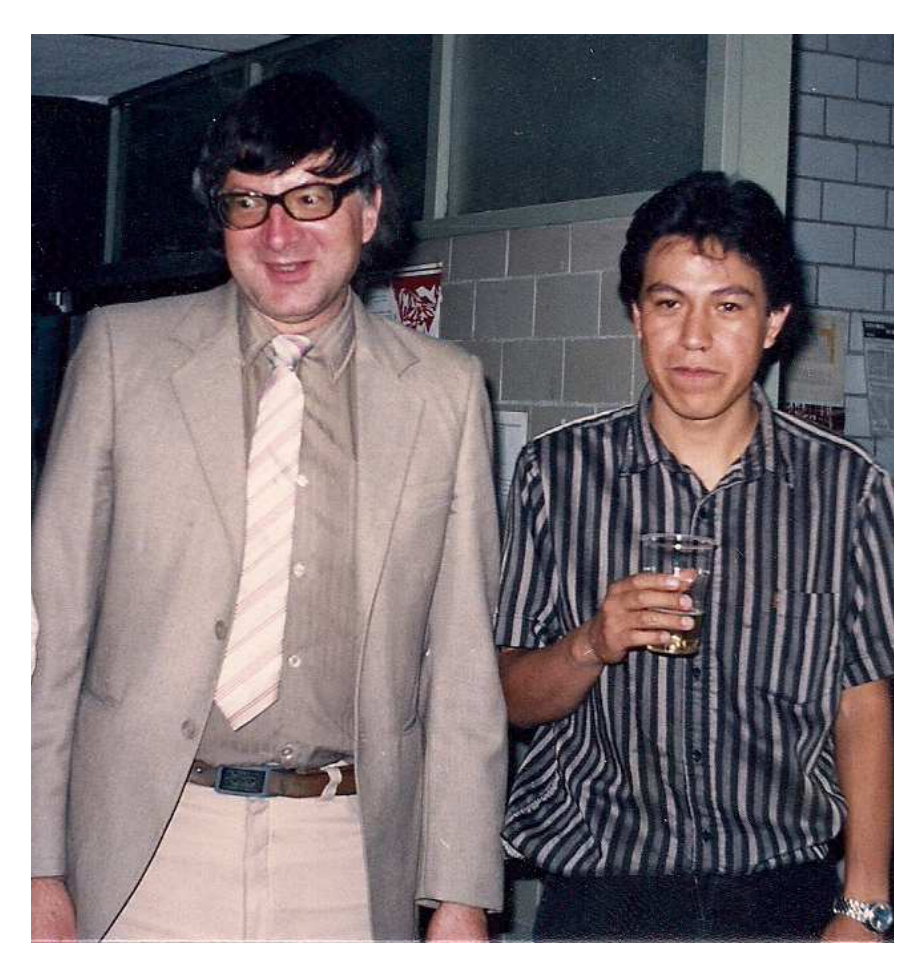
With me the day I got my PhD